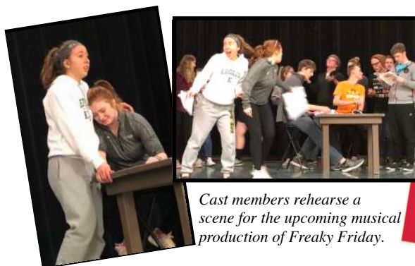
Cast members rehearse a scene for the upcoming musical production of Freaky Friday .

Prior to the musical, stop in to the high school and check out hundreds of works of art created by Evergreen students in grades K-12. The Art Show will be open from 5:30-7:15 pm on both evenings before the musical. Don't miss this weekend of Evergreen art at its finest!